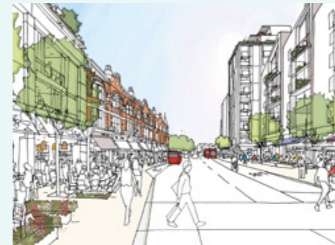
An initial sketch of the proposed redevelopment of Edmonton Green. This shows the perimeter of the site along Fore Street.