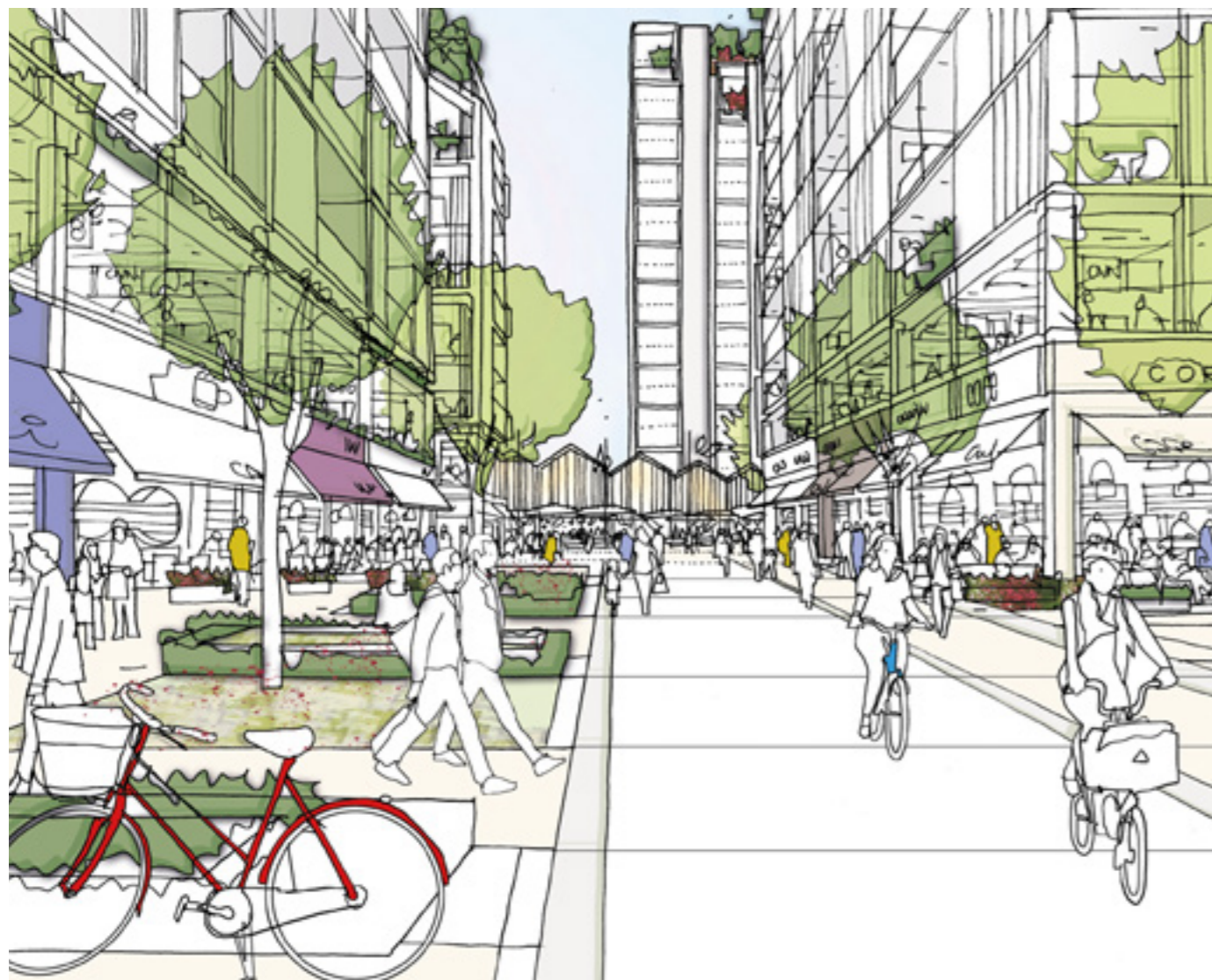
An initial sketch of the proposed development of Edmonton Green.