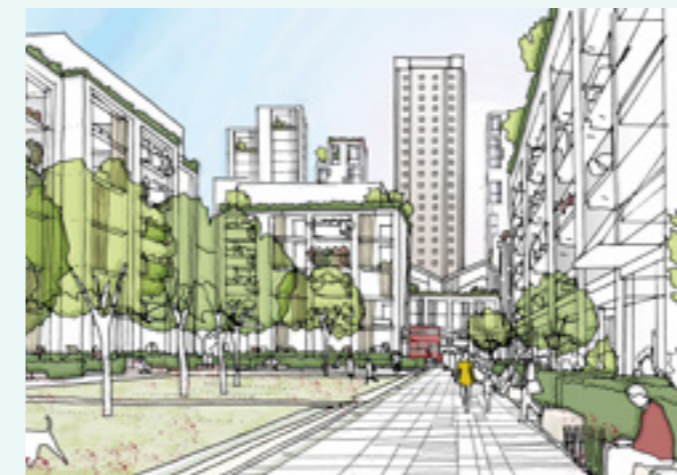
An initial sketch of the proposed redevelopment of Edmonton Green. The buildings would offer a mix of uses with shops and restaurants on the ground floor and homes situated above.

A number of new residential buildings of varying heights are envisaged across the scheme, reducing the dominance of the existing towers.