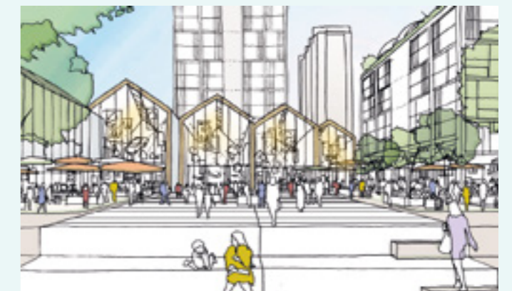
An initial sketch of the proposed redevelopment of Edmonton Green. This shows the new Market Square.

We also want to join-up Edmonton Green with Fore Street and make it better connected. In addition we want to improve pedestrian routes through the shopping centre and minimise back of house areas, further helping to reduce anti-social behaviour.