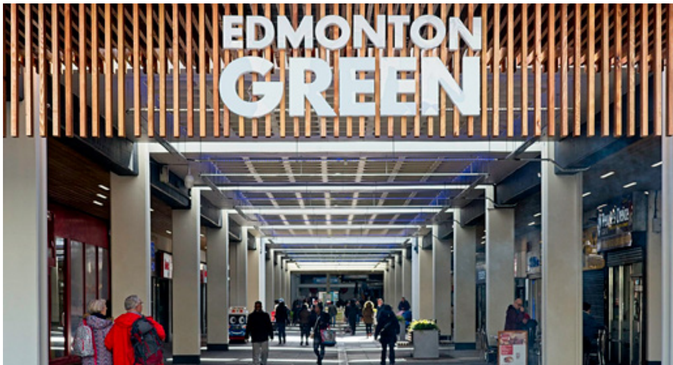
Current image of Edmonton Green shopping centre.